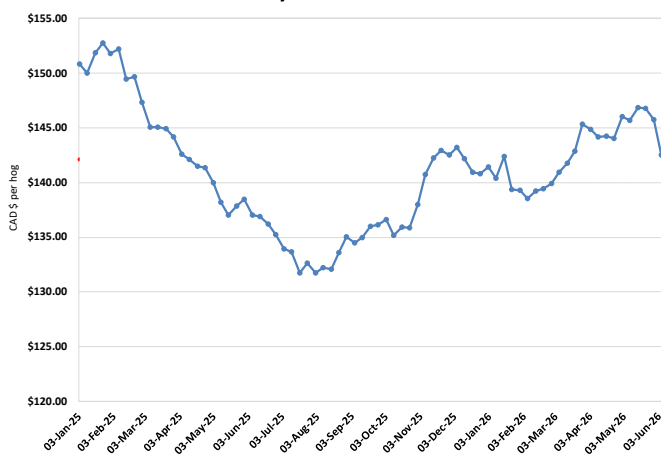
Average Western Canadian Margins 2021-2026