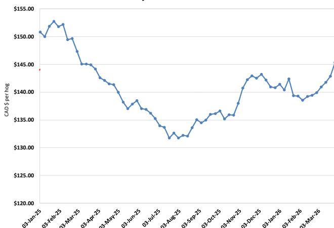
Calculated Weekly Can Farrow-Finish Feed Cost