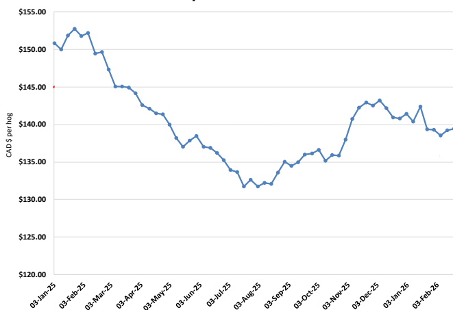
Average Western Canadian Margins 2021-2026