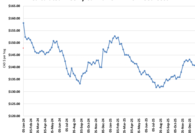
Calculated Weekly Can Farrow-Finish Feed Cost