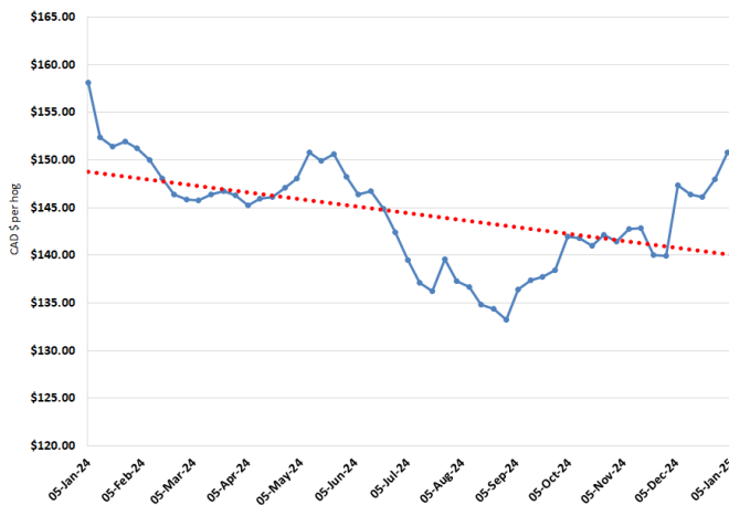
Canadian Margins 2024-2025