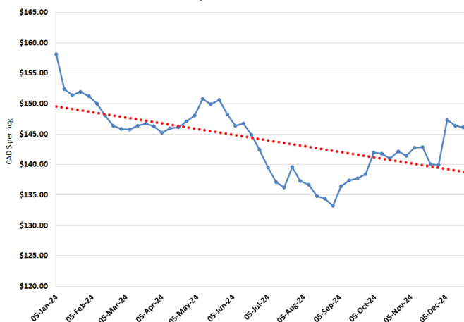
Canadian Margins 2023-2024