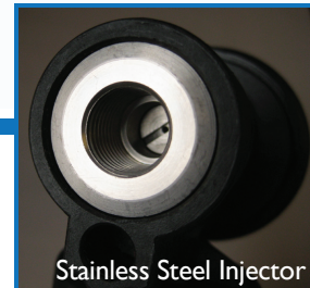
Stainless Steel Injector

airless STAINLESS STEEL CHEMICAL INJECTOR