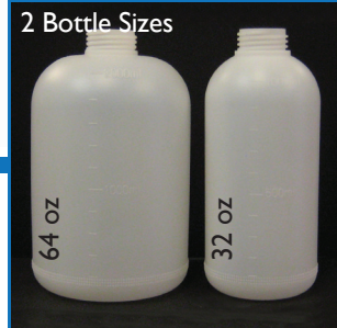
2 Bottle Sizes